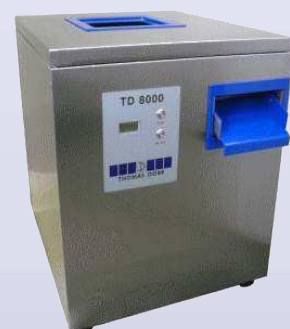
Cutlery polishing machine TD 8000